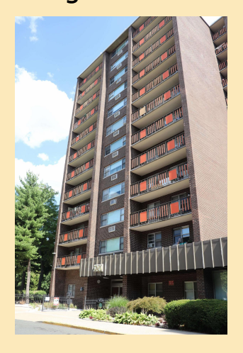
510 E. Front Street, Plainfield, NJ 07060