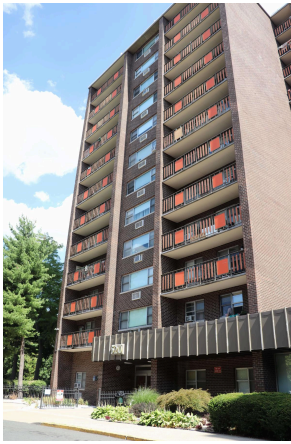
510 E. Front Street, Plainfield, NJ 07060