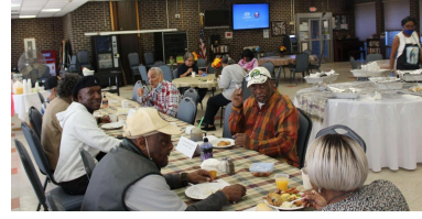
Richmond Towers Residents Association Annual Veterans Breakfast sponsored by HAP