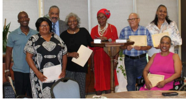
Richmond Towers Residents Association Swearing in Ceremony of new board on August 22